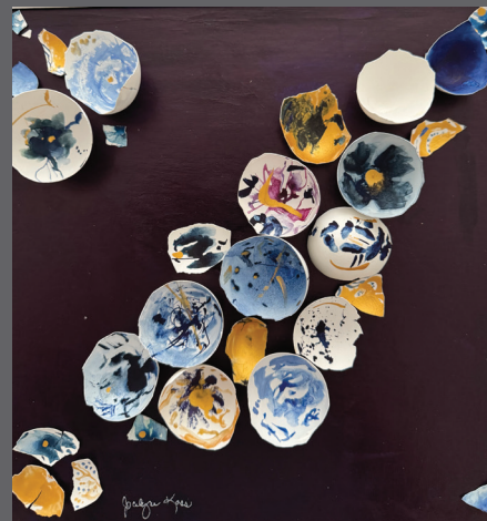
3 rd JOCELYNE KOSS Kintsugi – Watercolor – 20" x 20"