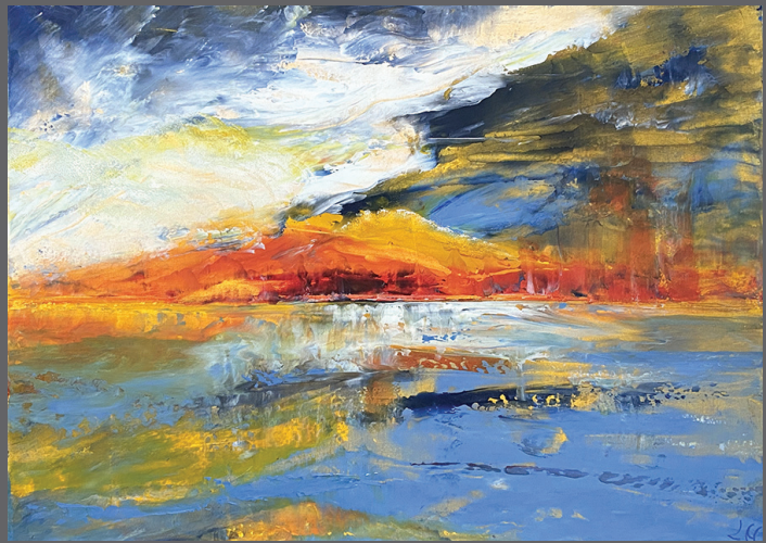
2 nd LAURENCE HERVIEUX Confins – Acrylic – 40" x 30"