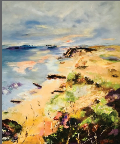
HONORABLE MENTION DANIELLE FORGET Aux Iles – Honorable Mention