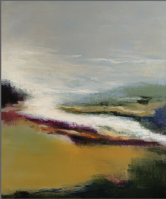
1 st FRANCINE CHOINIÈRE Lumière – Acrylic – 30" x 36"